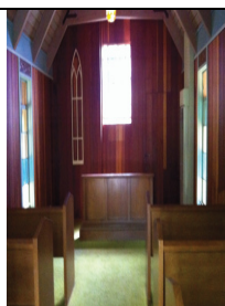
Small chapel seats 12 for prayers 小教會可容納 12 人 作禱告用途