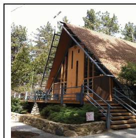
Main Chapel seats 270 大教堂可容納 270 人

1) 教會：橡樹格倫有兩個美麗的教堂。主要大教堂有270個座位可提供我們教會使用。第二個教堂有12個座位是專門用於祈禱和冥想，全天候開放給所有已登記的客人使用。